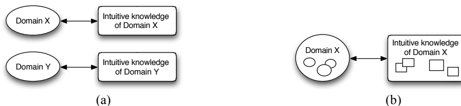
Figure 1: (a) A simple framework and (b) a slightly elaborated framework for describing intuitive knowledge.

We start with the simple notion, shown schematically in Figure 1a, that there are science domains and distinct bodies of intuitive knowledge that align, one-to-one, with each domain. Domain X is entirely separable from Domain Y and the intuitive knowledge of Domain X is separable from the intuitive knowledge of domain Y.